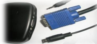
Emitter Vesa Stereo Plug