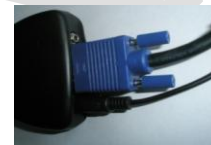
15Pin Plug to Monitor

3DTV Dongle (above) is a very common analog dongle for our emitters. It should be connected between PC graphic card and monitor's or 3D Ready dlp projector's 15pin plug. It has a jack for the Emitter miniDin VESA Stereo plug and a jack for any model wired glasses. This dongle is for input from pc's ONLY, not for use between 3D BluRay players or DirectTV 3D channels and your TV or projector. It will be replaced by our DVI/HDMI VESA SYNC SPLITTER (DSS) by May 2011. The DSS works with any frame sequential 3D input and is for CRT and 3D Ready DLP projectors or LED, LCD, LCOS, DLA and other types of 120hz 3D capable monitors or projectors.