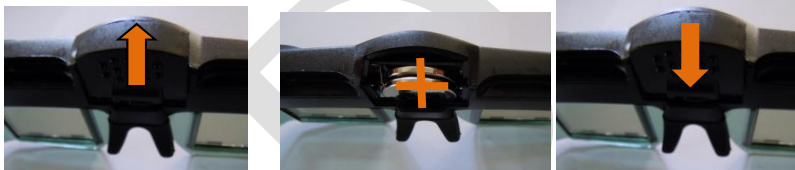
Open the cover

The battery level can be measured with a voltmeter and each CR 2032 battery should be 3V.